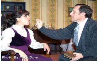
MY FAIR LADY